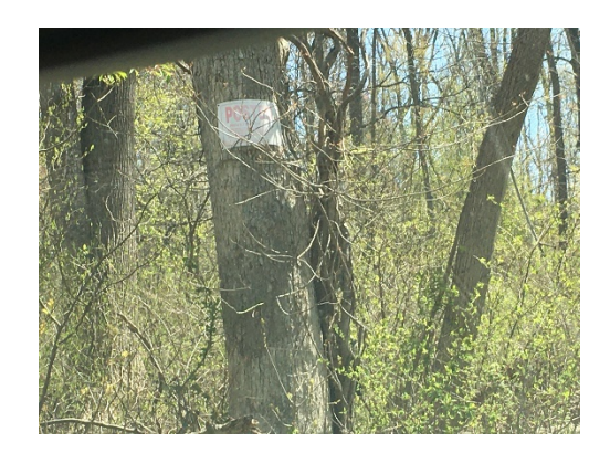
Ignore those signs and drive up the gravel driveway