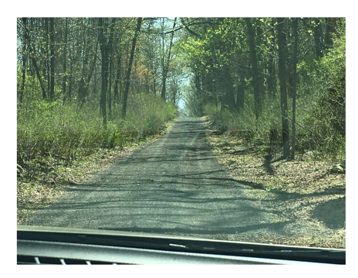
Follow that to the gate, and go straight through the "Stewardship Forest" gate