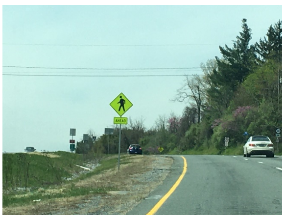
that will take to you The top of the hill, TURN LEFT on to Blue Ridge Mountain (BRM) Rd (601).